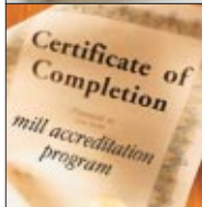
Supplier accreditation program

Committed to Excellence. Dedicated to Quality.