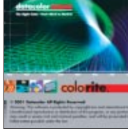
Color visualization system