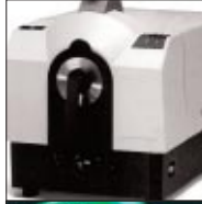
Color measurement system

You'll gain maximum benefit from your CIMS solution by using Datacolor's supplier accreditation program. This program ensures that your suppliers are complying with your color management processes.